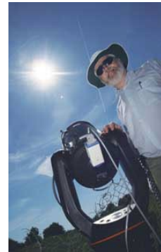
Where are you going to observe the 2012 Transit of Venus from ?

A link to their Facebook page as well as the sites of all the other SAGAS society members can be found on our website at www.SAGASonLine.org.uk .