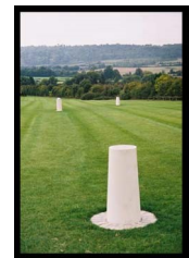
The Solar System Model at Otford, Kent. Well worth a visit

SAGAS Summer 2011 Meeting - can you bring a Solar Telescope or other material to the meeting ?